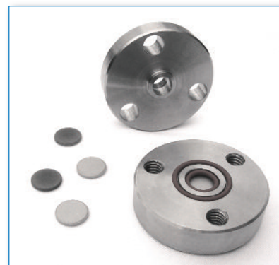
Disc Test Fixture Now Available