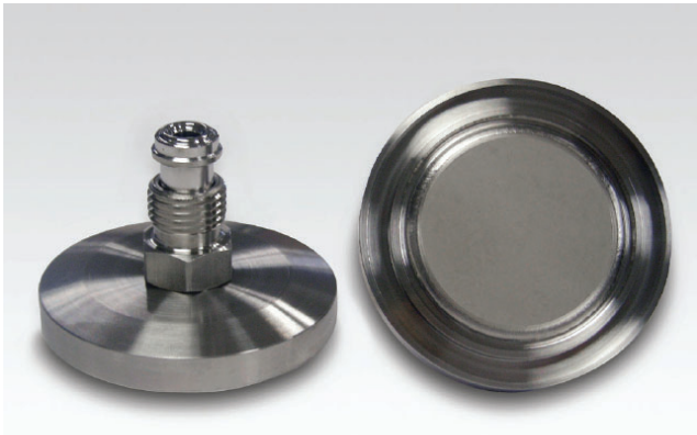
Performance Data for Mott GSE-FLG-2.0-F1-NW50-C22 Diffuser

GasShield® Diffusers quickly vent vacuum chambers to atmosphere, decreasing cycle time and increasing throughput while providing uniform and laminar gas flows without disturbing particles in the chamber. GasShield® Diffusers are proven to remove particles down to 0.0015 \mu\text{m} .