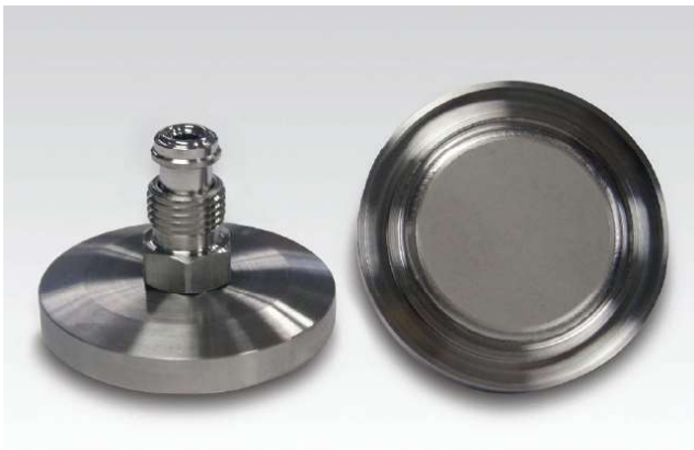
Performance Data for Mott GSE-FLG-2.0-F1-NW50-C22 Diffuser

GasShield® Diffusers quickly vent vacuum chambers to atmosphere, decreasing cycle time and increasing throughput while providing uniform and laminar gas flows without disturbing particles in the chamber. GasShield® Diffusers are proven to remove particles down to 0.0015 \mu\text{m} .