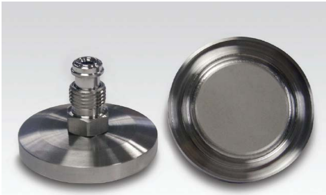
Performance Data for Mott GSE-FLG-2.0-F1-NW50-C22 Diffuser

GasShield® Diffusers quickly vent vacuum chambers to atmosphere, decreasing cycle time and increasing throughput while providing uniform and laminar gas flows without disturbing particles in the chamber. GasShield® Diffusers are proven to remove particles down to 0.0015 \mu\text{m} .